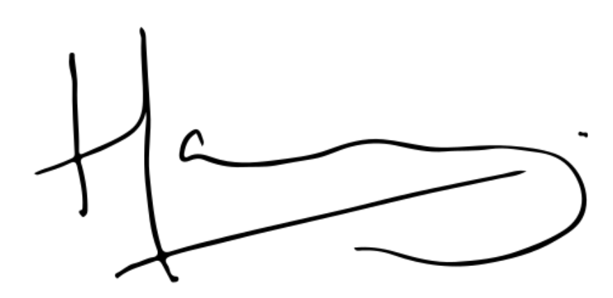
Prince harry's signature

37th president of united states of america developed threading over a period of time.